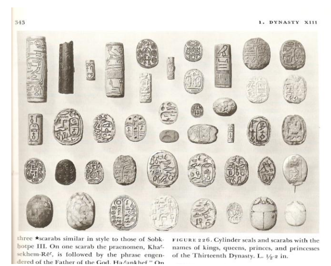
<u>Figure 3</u> <u>Cylinder Seals and scarabs with the names of kings, queens, princes, and princesses of the Thirteenth</u> <u>Dynasty from The Scepter of Egypt by William C. Hayes, page 343, Figure 226</u>

The names and titles of Pepi II are found on page 129 (William C. Hayes, <u>The Sceptre of Egypt</u>, Volume I): "A graceful alabaster ointment vase of Pepy II bears on its side a panel of inscription with the king's names and titles: "The Horus Netery-kha-u, King of Upper and Lower Egypt, <u>Nefer-ku-re</u>, given life, like Re". On page 342 is described a scarab of glazed steatite with the names of King <u>Nefer-ku-Re</u> (Neferkare or Pepi II of dynasty VI) and Khendjer I (of dynasty XIII) engraved side by side. Khendjer I is listed as 17<sup>th</sup> (Turin Papyrus) in dynasty XIII. Other scarabs with engravings of kings of dynasty XIII are associated with long lived Neferkare (Pepi II) of dynasty VI. (William C. Hayes, <u>The Sceptre of Egypt</u>, Volume I, page 342). Below in Figure 3 are royal seals and scarabs found in the tombs of pharaohs of the 13<sup>th</sup> (XIII) dynasty.