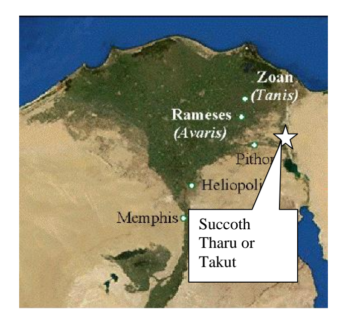
<u>Figure 7</u> <u>The Egyptian delta and the "land of Goshen" (Green area)</u>

Where one would leave Egypt proper and go into the Sinai desert, there was a fortress and a bridge. Inscriptions tell us that this fortress was called Tharu (or one of the various spellings). It is located near the Delta, or "Rameses," where the Israelites were living, and was where the Egyptian army assembled in preparation for their military expeditions to the north. Armies consisted of a great deal of men, horses and chariots; and they required logistics and a large area to assemble properly. Tharu may well have been the biblical "Succoth". They had left Egypt proper once they crossed this line of fortification, just as recorded in the biblical record: "...and the children of Israel went up harnessed out of the land of Egypt." (Exodus 13:18)